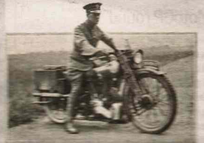
It's hard to think of Brough without thinking of Captain T.E. Lawrence

However, the outbreak of the Second World War prompted the end of motorcycle production in 1939 when the factory was turned over to aircraft engine production. It never resumed. Up to then, only 3000 Broughs had been made, one